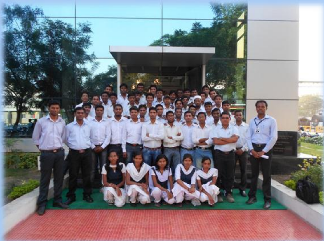
Students and faculty in Mahindra & Mahindra Ltd. Nagpur